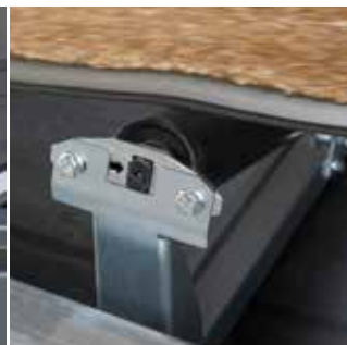
Carrying idler set.